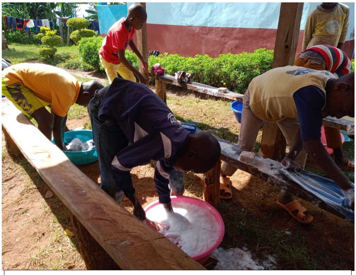
Young busy washing their clothing's being assisted by the dorm father