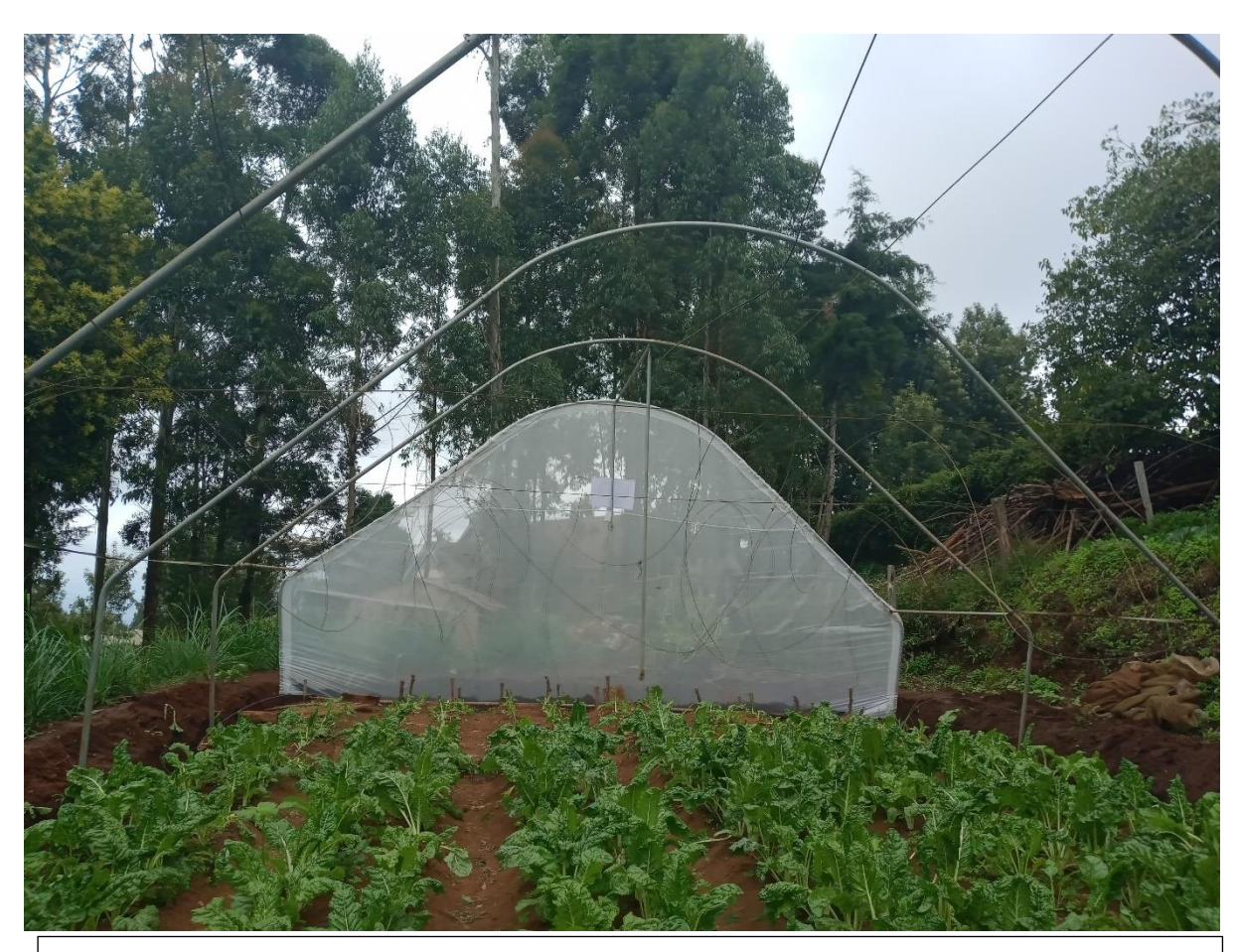
Big trees surrounding the green House vicinity