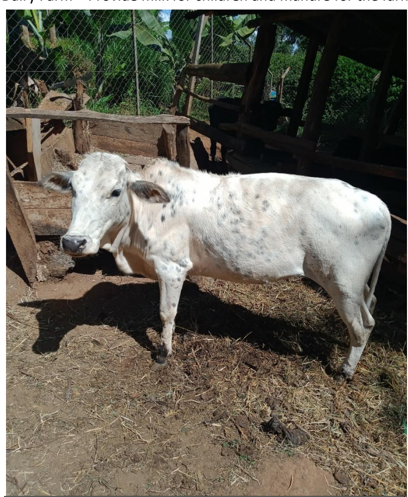
Heifer donated for children and other three dairy cow gives milk for children.

2. Dairy Farm – Provide milk for children and manure for the farm utility.