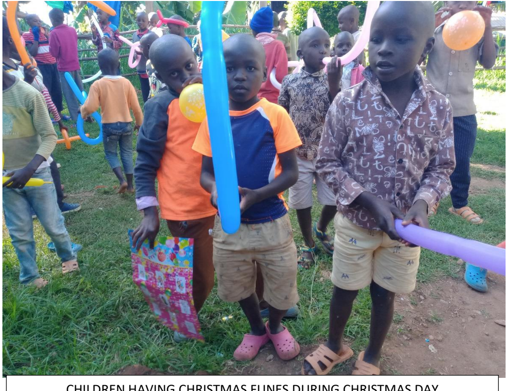
CHILDREN HAVING CHRISTMAS FUNES DURING CHRISTMAS DAY

The children who fall sick are taken for medication and any necessary attention taken for life safety. Children are provided with balanced three meals daily. Their residential houses are well furnished for conducive living environment. Also, the board ensures there is provision of good beddings and children wearing clothes.