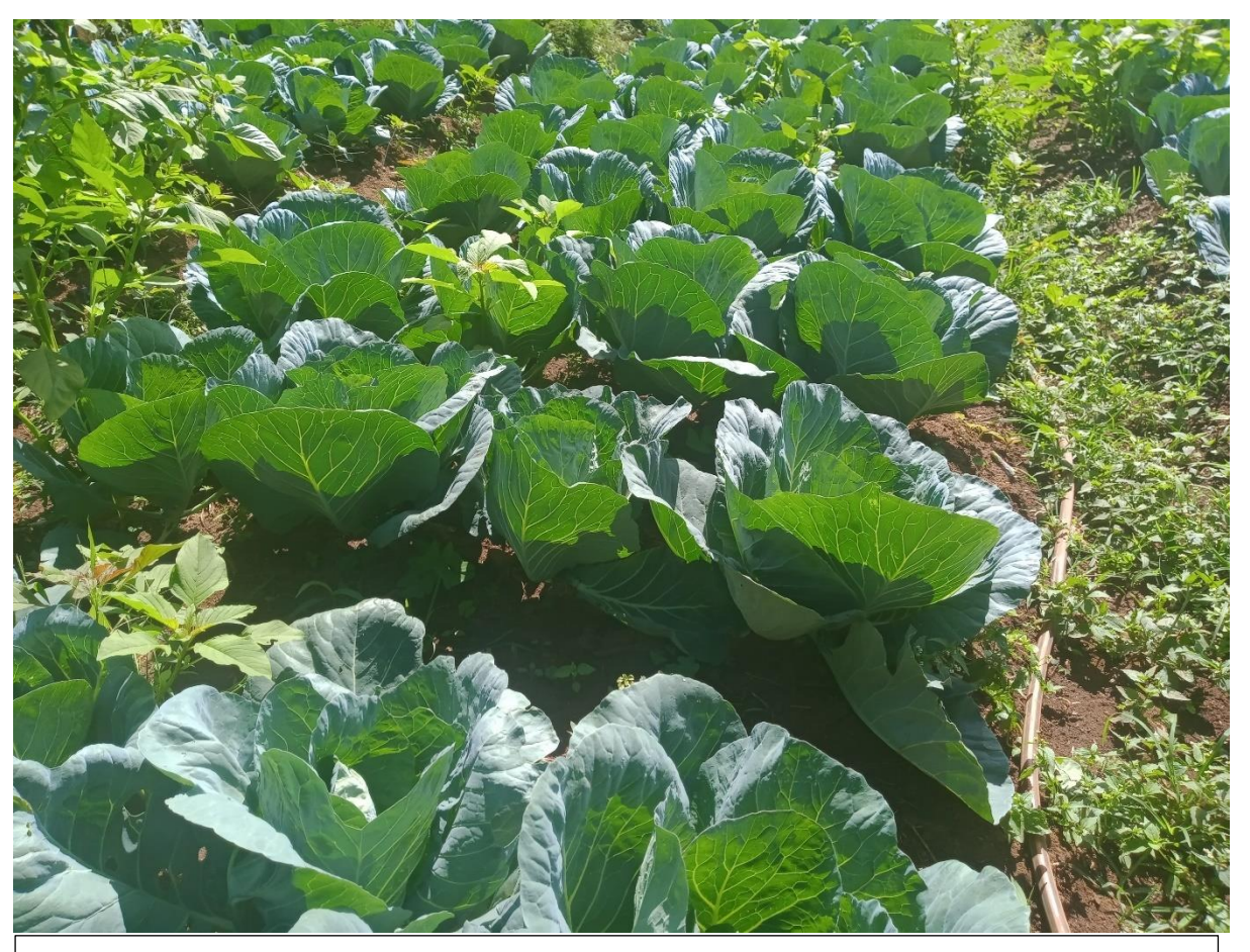
Cabbages grown outside our green House not sell but for children consumption

4. Horticulture – The home has small farm. Provide greens and other farm produce.