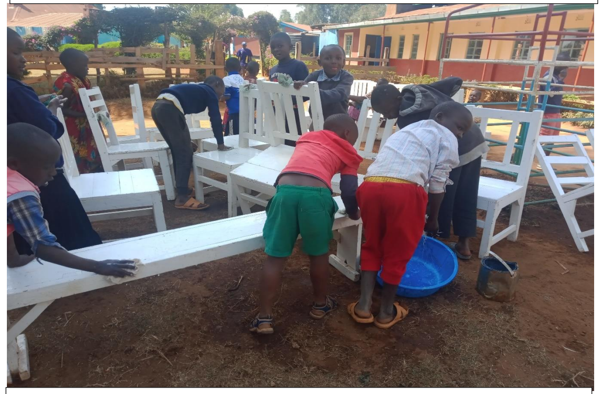
Children busy washing dining chairs