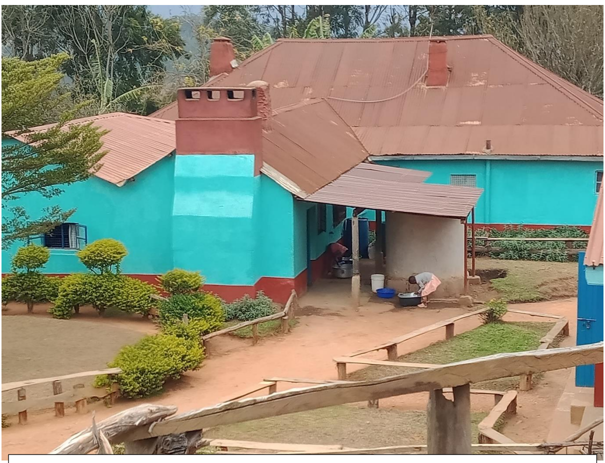
Main House where there is Managers room, Visitors Rooms, Small boys' dorm and main office

AIC Mbooni Children's home was started on 29<sup>th</sup> June 1979 by of Africa Inland church - Kenya. The sole objective of the home was to uplift the vulnerable and needy children in the society. Over the years, the home has been focusing to its objective and many children have graduated in various career courses like health workers, Pastors, Accountants, Teachers, Bankers, Engineers, ect.