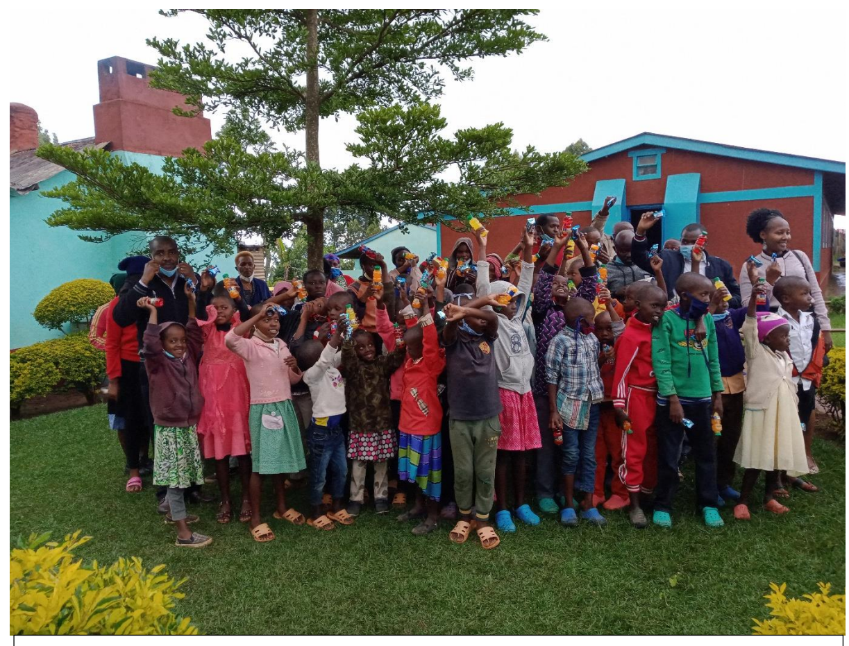
CHILDREN ENJOYING SODA WITH VISITORS