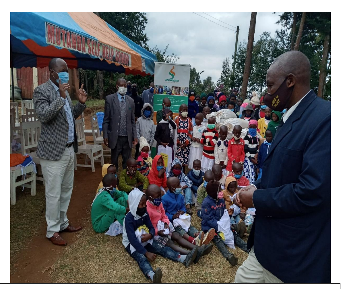
CHILDREN BEING ENCOURAGED AND ADVISED BY MAKUENI COUNTY OFFICERS ON THEIR MORAL LIFE

The children are also given social Psyche support through counselling and regular mentorship arranged forums. This empowers them learning of life skills like washing, cooking, clothing, cleanliness and doing farm duties.