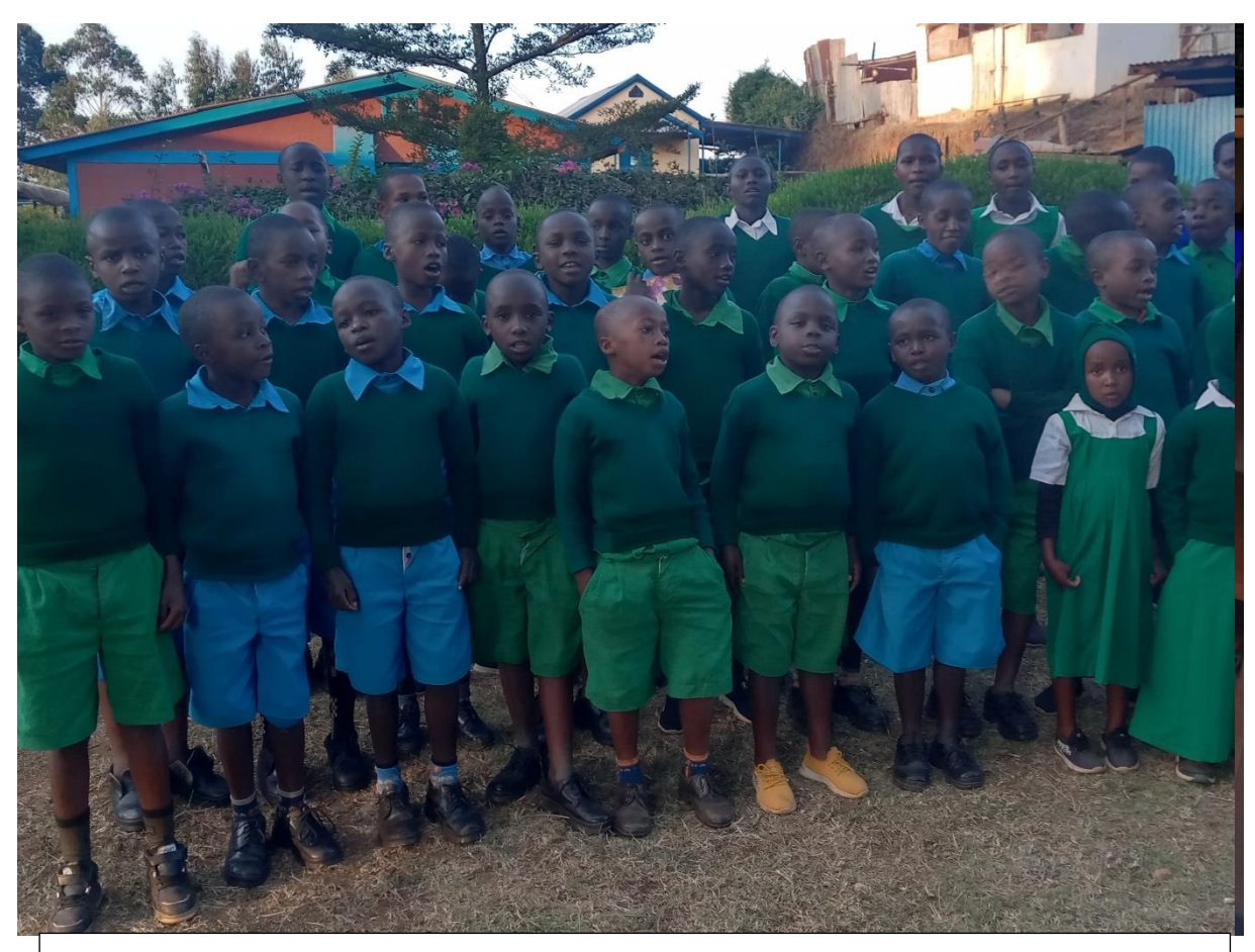
CHILDREN IN PRIMARY SCHOOL-THOSE IN GREEN SHORT AND ALSO DRESS ARE CHILDREN MBOONI AIC PRIMARY. THOSE IN BLUES SHORTS AND BLUE DRESSES ARE FOR YAMBAE PRIMARY